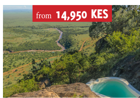
MASAI MARA MARA SIRIA CAMP

Per person/night, full board, from Until 15.06: 13,500 ..... From 16.06: 18,000